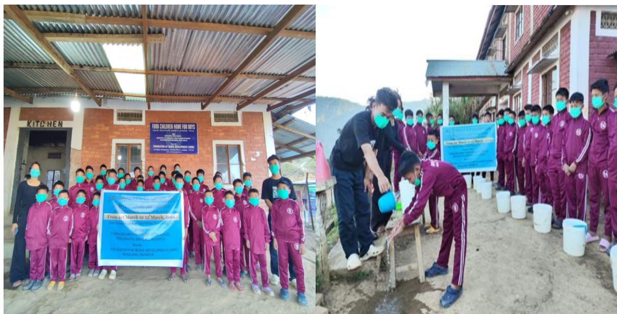
Activities taken up during the year, 2023-24

The Foundation of Rural Development (FORD),Wangjing Heitupokpi, Manipur is running one Children Home for Boys at Machi, Tengnoupal District, Manipur with the grant-in-aid under the scheme of Mission Vatsalya, Ministry of Women & Child Development, Government of India through the Department of Social Welfare, Government of Manipur for providing socio-economic rehabilitation of 50 (fifty) Children, who are in dire need of care & protection. From time to time advocacy programme on Child Rights was also organized for the stakeholders in order to protect their rights and to help them grow as a productive and responsible citizen in the days to come. They are provided free schooling, fooding & lodging and other basic necessities.